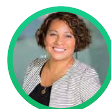
US Investment Firm Operations Manager

“The best Salesforce vendor I have ever worked with, and I’ve worked for Salesforce and with Salesforce for years...”